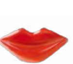
Lips ●🍷 Filling: liquid strawberry cream