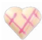
Caramel Heart ●🍷 Filling: caramel