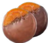
Luna ●● candied orange slice