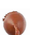
Cherry in liqueur ●🍷 Filling: cherry with stone in liqueur