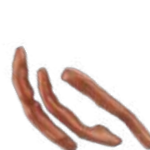
Orangettes ● candied orange peel