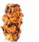
Orange truffle ●