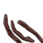
Orangettes ● candied orange peel