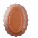
Speco ● Filling: gingerbread praliné