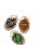
Liqueur pralines ●🍷 Filling: real liquid alcohols